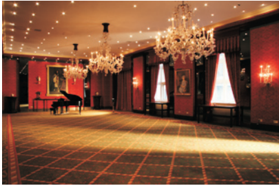
The Grocers' Hall The Worshipful Company of Grocers Princes Street, London EC2R 8AD